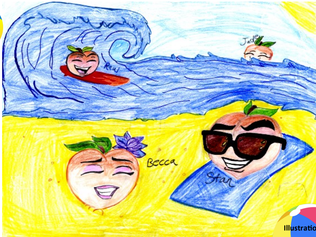
Illustration by: CuRay @ Murrieta Summit